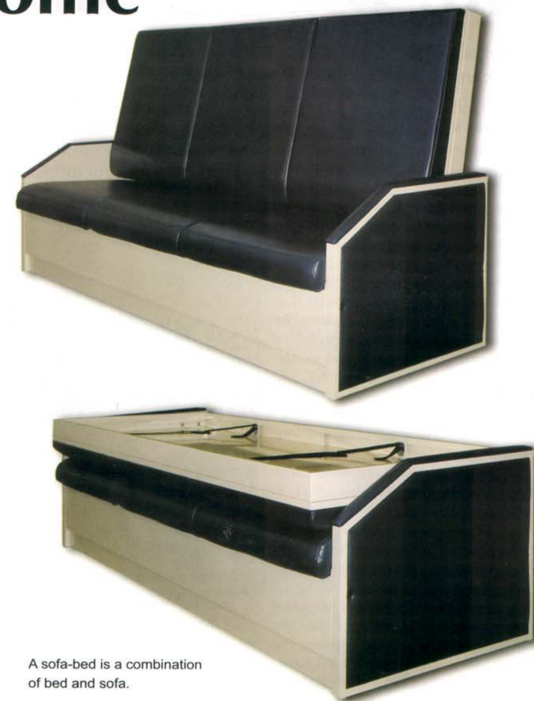
A sofa-bed is a combination of bed and sofa.

Additionally an emergency hatch, ventilation grating and a self-closing unit can be assembled in the door.