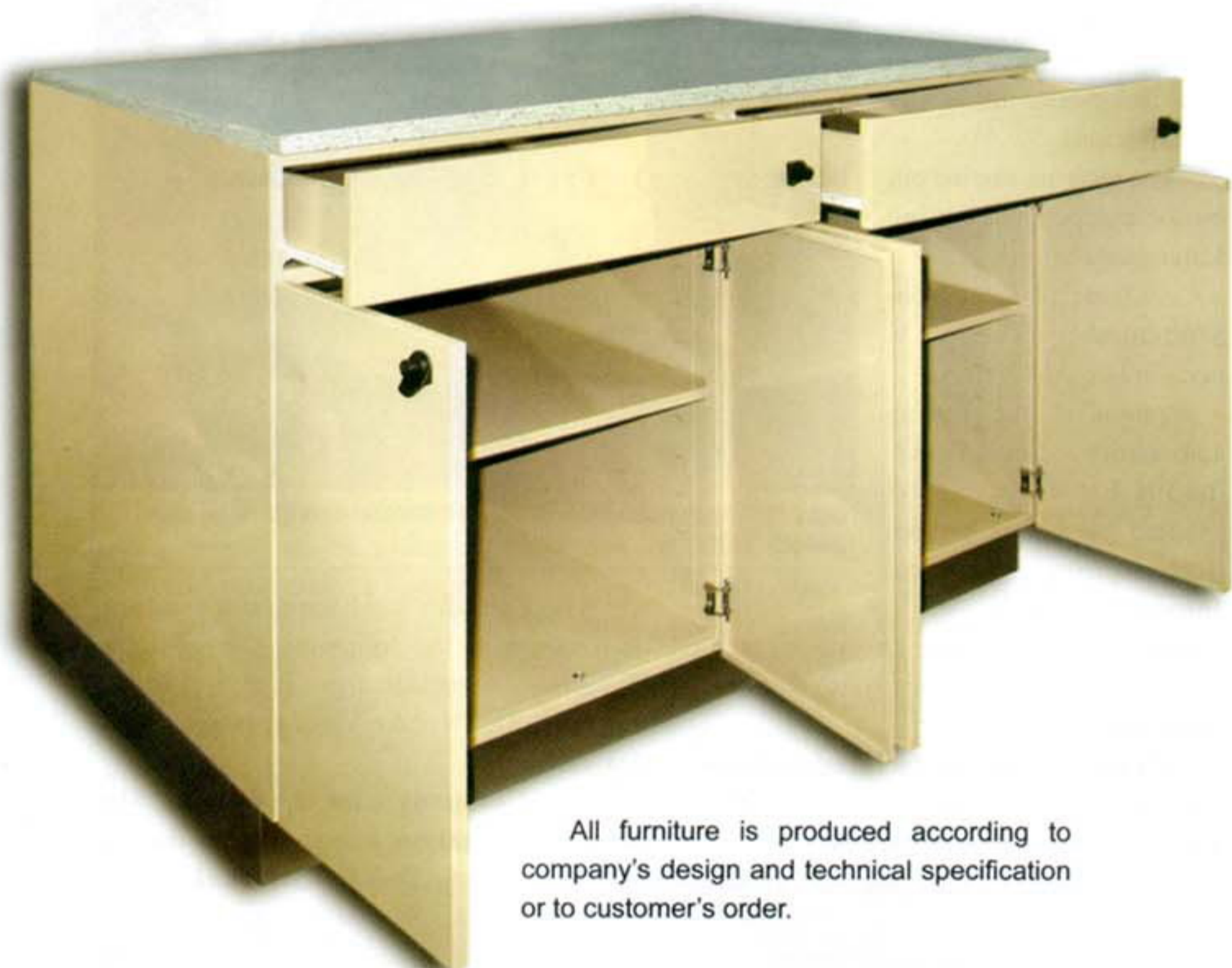
All furniture is produced according to company's design and technical specification or to customer's order.

- We have gained 15 year experience in sheet treatment, inclusive stainless steel and aluminum- informs Patryk Wolsza, marketing specialist in BANCO. - We have got CNC angle bending machines, CNC contour band saws, eccentric presses, section form rolling machines integrated with rolling mills, spot-welding presses, TIG-MIG welding stands, powder painting room, complete series of types of machines and devices